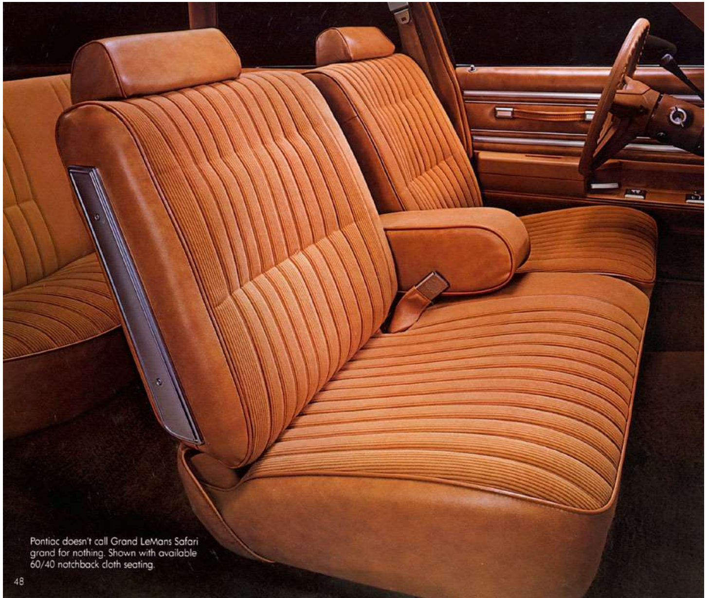
Pontiac doesn't call Grand LeMans Safari grand for nothing. Shown with available 60/40 notchback cloth seating.